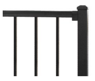
Aluminum Rail & Round Baluster Kit