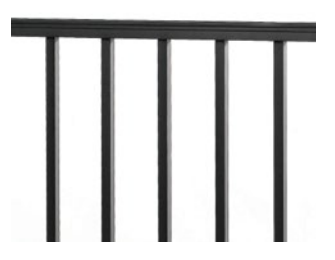
Aluminum Assembled Square Baluster Panel